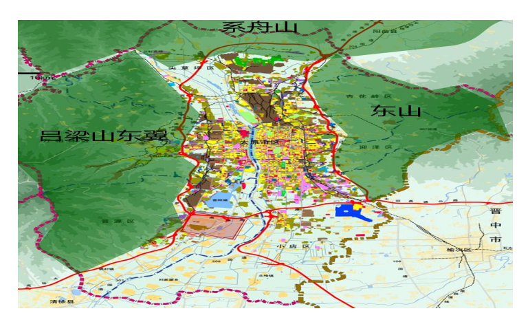
Figure 1. Topographic and geomorphologic map of Taiyuan